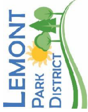
LEMONT PARK DISTRICT ORGANIZATION CHART